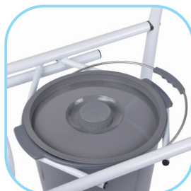
Bucket + lid